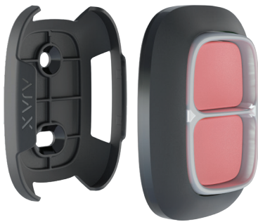
Holder for Button/DoubleButton is sold separately